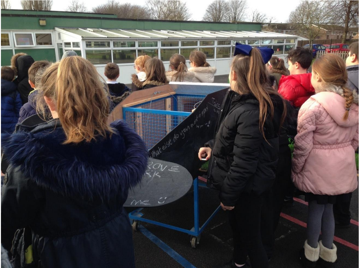
A Class engages with the plane and ideas for the development