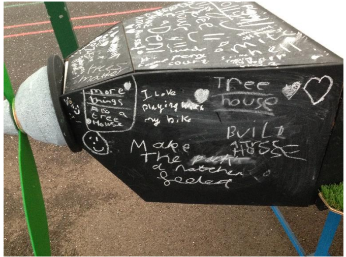
Above left and clockwise: The Green grass wings and activities to 'like' with a heart; writing on the plane from an engagement session with children; the paper aeroplane comments.