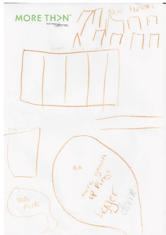
New houses, more grown up things, bigger dome