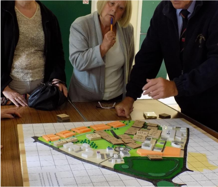
Model in use – Summer 2017

3.5 Consultation on the final masterplan and its proposals for the site gathered widespread support at the end of 2017, as its production coincided with Bristol City Council consulting on their own proposals for developing the Park. The council produced 4 options, and the Forum called their masterplan Option 5. The council's results showed considerable support for option 5! Discussion around options with the Council has been productive, they extended their consultation due to pressure from the local community, and proposals from Bristol City Council are reflecting work in the masterplan to some extent.