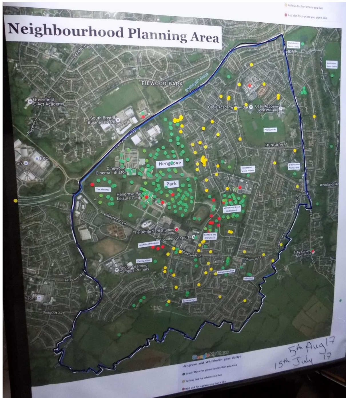
Table 2: Results of Dots Exercise from both Drop-in Events

The overall results from both sessions are shown in figure 2 below. The spread of residents covered the neighbourhood area reasonably well, although there was a concentration nearer the scout hut where the event took place (south east corner of Hengrove Park), and from the St Giles Estate which is closest to the proposed development.