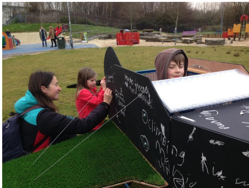
Writing and Playing with the Plane