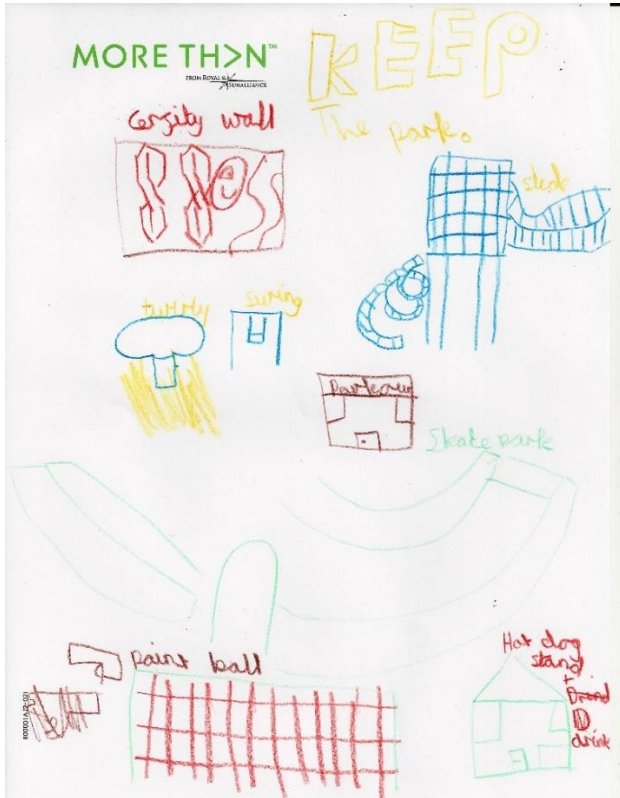
Graffiti wall, paint ball, Park office, hot-dog stand skatepark, climbing frame (blue) and message re "Keep the Park".