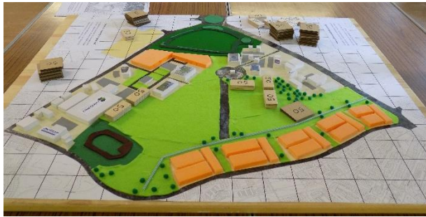
Figure 1: Pictures of suggested layouts for housing on the Park from the drop-in events